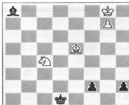
(2) A study by Henri Rinck

Solutions on back page. The second one is not easy! Thanks to "Chess" magazine (as was) for introducing me to these.